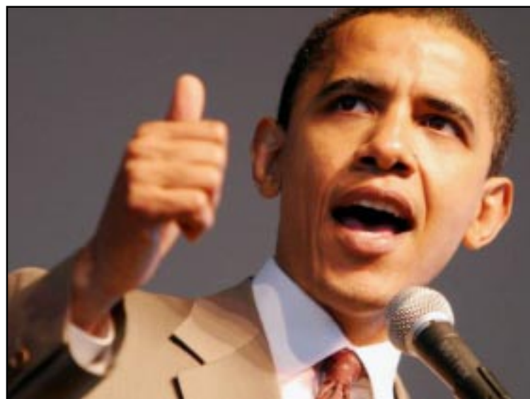
Senator Barack Obama

Think about whether you want a President like Barack Obama who will work with