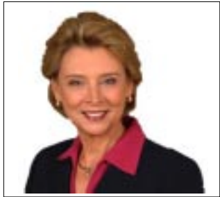
Christine O. Gregoire