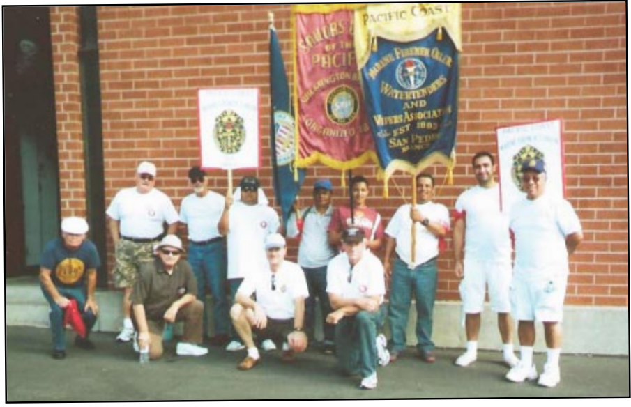
SUP and MFOW members readying themselves for the Labor Day Parade Solidarity March on September 3, in Wilmington.

The International Longshore and Warehouse Union, Local 142, and the NLRB had found that HTH consistently defied labor laws and worked against the Union since 2002. Local 142 alleged that the company had "withdrawn recognition of the Union without just cause, unilaterally changed the terms and conditions of employment, threatened and terminated hotel employees who were active with the Union, and failed to release to the Union information necessary for collective bargaining."