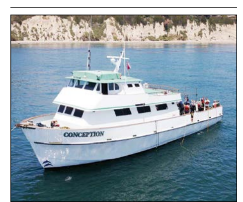
The dive boat Conception before fire, sinking and salvage, was classified by the Coast Guard as small passenger vessel, and is now the subject of various investigations. In the immediate aftermath of the disaster the Coast Guard issued a Marine Safety Information Bulletin to the industry covering requirements such as numbers of passengers permitted, fire-fighting and suppression equipment, crew training, and documentation unsupervised charging of lithium-ion batteries and extensive use of power strips and extension cords.

The accident occurred on the final day of a 3-day dive excursion to Southern California's Channel Islands.