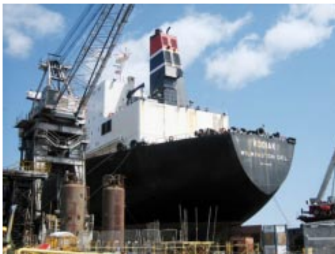
The Kodiak docks stern-in at San Francisco Dry Dock and Ship Repair on April 20. This is the first time a SeaRiver vessel has undergone a full yard period in San Francisco in nearly ten years.