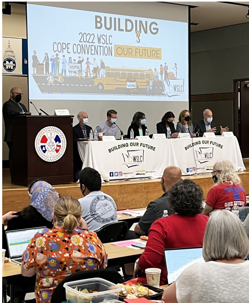
Saturday's congressional panel included (seated from left) Reps. Adam Smith, Derek Kilmer, Marilyn Strickland, Suzan DelBene, Kim Schrier and Rick Larsen.

Also unlike corporations and industry groups — which outspend unions about 24-to-1 on politics — labor's endorsement and support doesn't just come in the form of a campaign contribution. It comes in the form of volunteers who do household walks, worksite leafleting, and make personal (not automated) phone calls to other voters, particularly fellow union members. It also includes direct mail and other forms of political outreach intended to explain why endorsed candidates and ballot measures have earned labor's support.